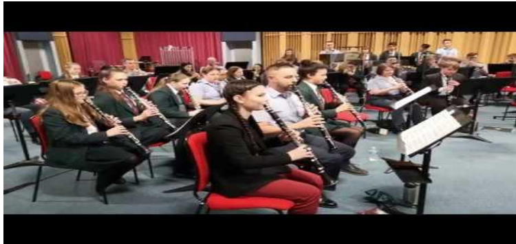
Vyners/RAF Music Concert Band Day

"I like being part the music department because there are loads of opportunities given to us like the wide variety of bands. It's also a great way to meet new people and make new friends."