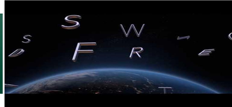
Vyners Lockdown Video with Special Guests